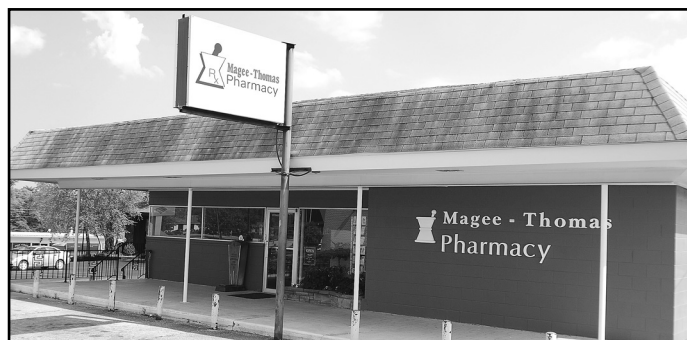
Located one block east of the Mountain Home Square, on the corner of 7th and Shiras Streets.